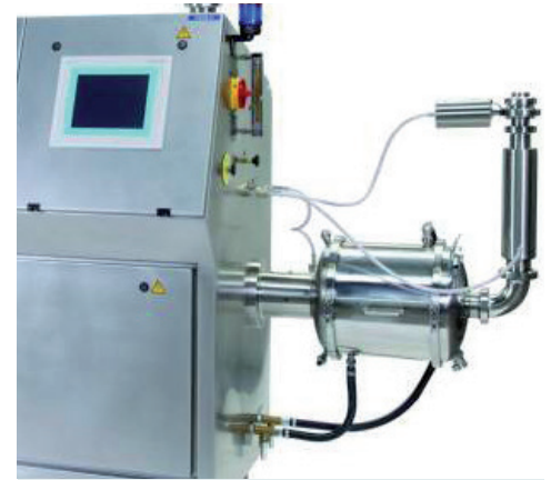
Continuous aeration mixer