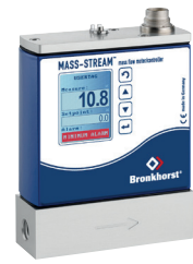
MASS-STREAM Series D-6300

This application note introduces aeration representing several ideas for using our instruments in different industrial sectors. Aeration is a process which circulates, mixes or dissolves air (or other gases) in a liquid or substance.