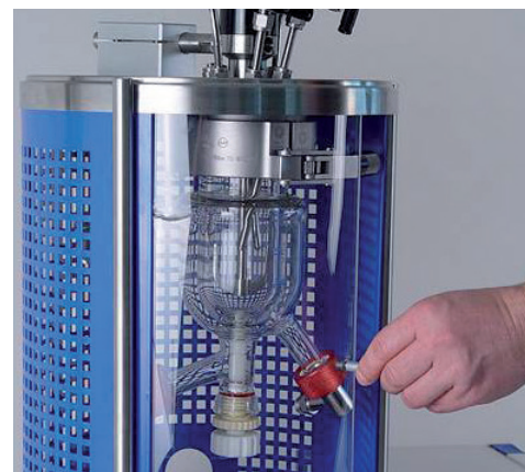
Compact lab reactor system for low and high pressure reactions, with interchangeable glass and steel pressure vessels